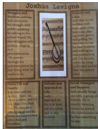
Photos are of the Bioflyer Project, during which students were assigned an 8th grade partner they didn't know very well, to interview, collect data about, and then compose a two page biographical flyer on. They did a great job!