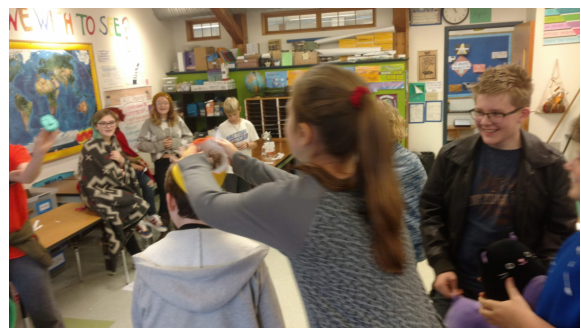
Social Studies: The crowning of a new emperor in the Qin Dynasty, China